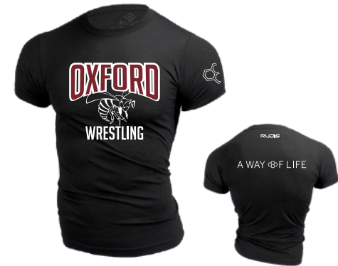
Black Super Soft Tee