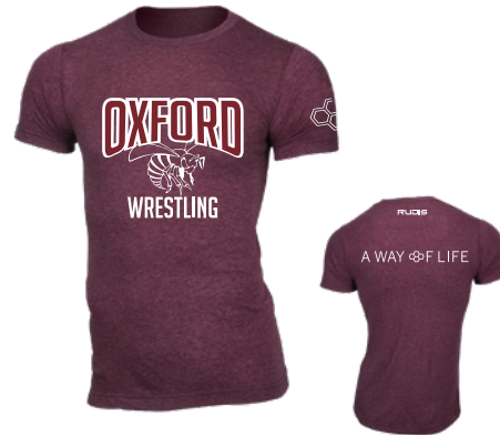
Maroon Super Soft Tee