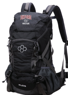
Genesis Gearpack V $79