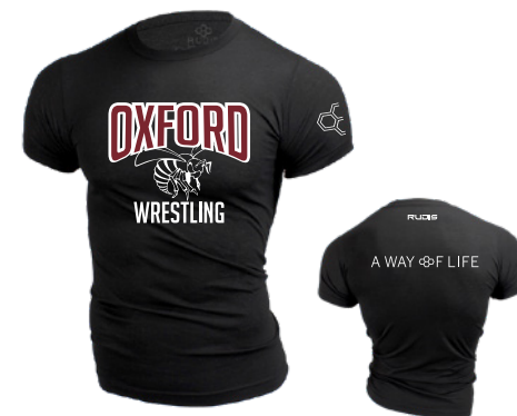
Black Super Soft Tee $20