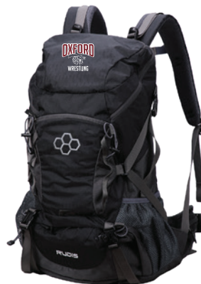
Genesis Gearpack V