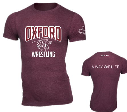
Maroon Super Soft Tee $20